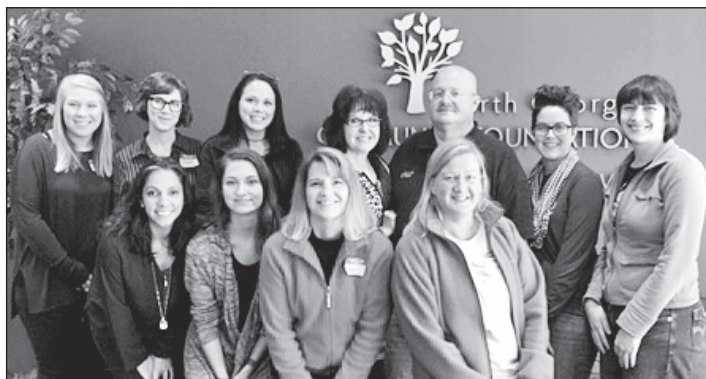
Fall 2015 Volunteer Training