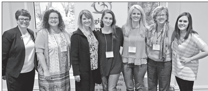
RR staff and volunteers attending the Georgia Commission on Family Violence Conference in Athens, GA.