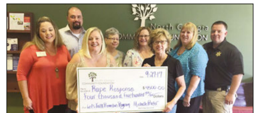
North Georgia Community Foundation Community Impact Grant Award; L-R: NGCF Staff & RR Executive Committee